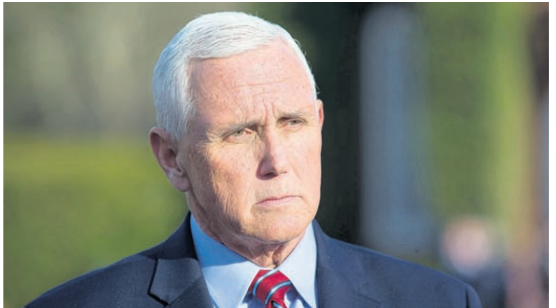
Former Vice President Mike Pence speaks to reporters before the MockCon event at University Chapel at Washington and Lee University, March 21, 2023, in Lexington, Va.

Pence has spoken extensively about Trump's pressure campaign urging him to reject Biden's victory in the days leading up to Jan. 6, including in his book, "So Help Me God." Pence, as vice president, had a cere-